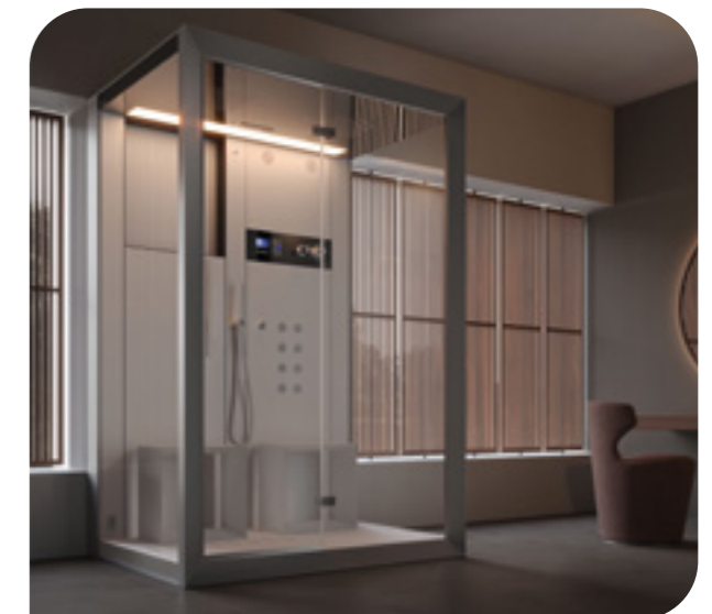
SHOWER & STEAM