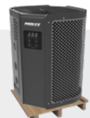
Delivered on a wooden pallet