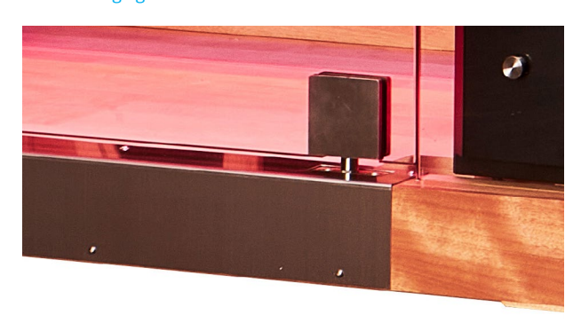
Heavy Duty Construction

Metal threshold, upgraded hinges and a replaceable solid wood floor will withstand heavy sauna use.